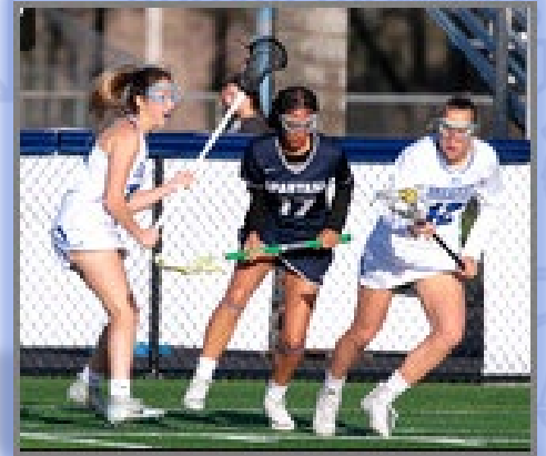
BASEBALL • GOLF • BOYS LACROSSE • GIRLS LACROSSE