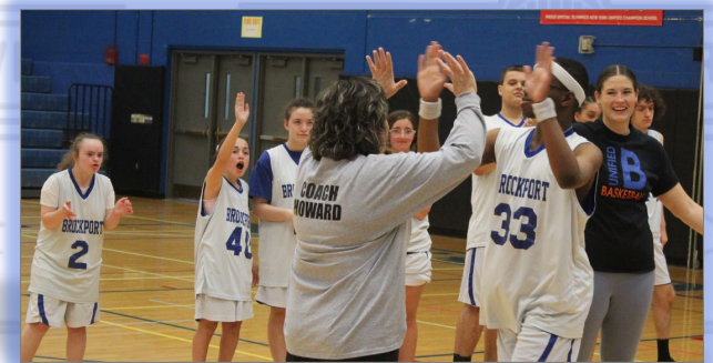
SOFTBALL • BOYS TENNIS • TRACK & FIELD • UNIFIED BASKETBALL